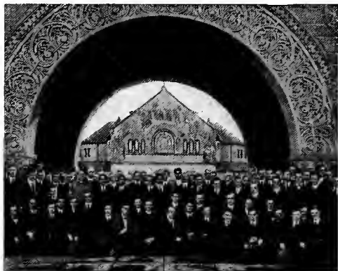
A CONFERENCE HELD TO CONSIDER THE MINISTRY AS A LIFE WORK

The Association encourages such activities as will give this training, and furnishes a clearing house for sharing methods and ideas. Through the Association also theological students have a clearance for helpful relations to the other students of their own generation.